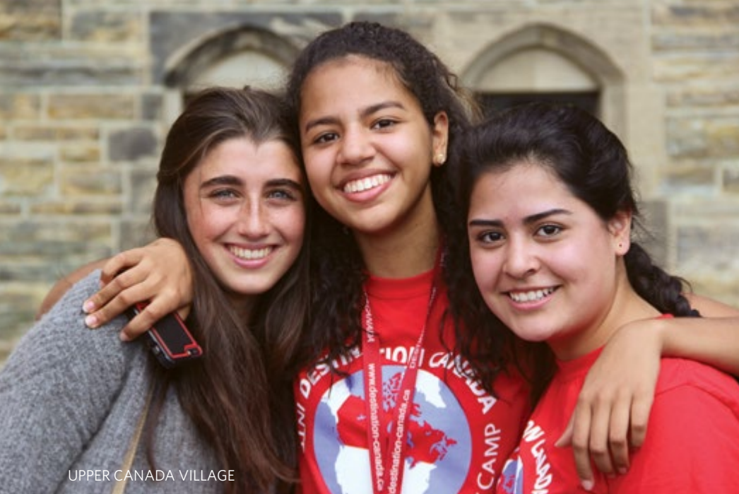
UPPER CANADA VILLAGE